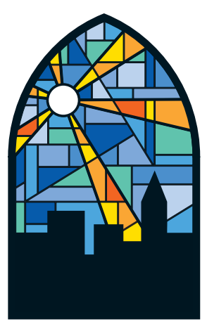
CENTER FOR RESEARCH ON RELIGION AND URBAN CIVIL SOCIETY